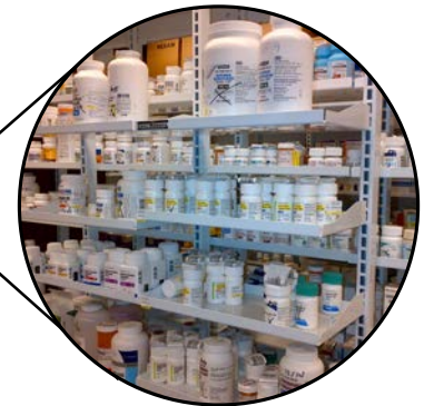
Space-efficient modular bay units