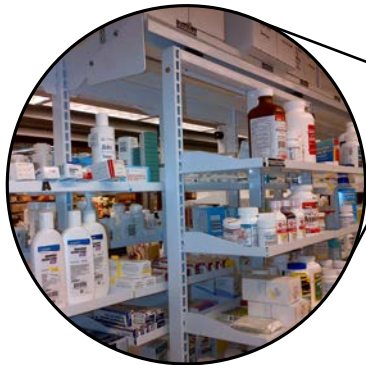
Slim profile for better visibility

Madix recognizes and addresses how little space you have to dedicate to prescription fulfillment. The innovative Back-to-Back Rolling Rx Unit makes filling prescriptions easier and more productive for your pharmacists and staff.