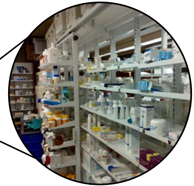
Sliding panels allow for 55% more shelf space