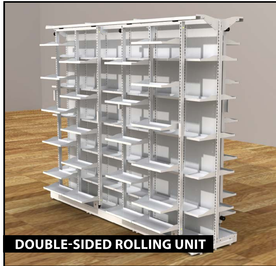
DOUBLE-SIDED ROLLING UNIT