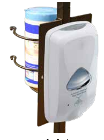
Rear Panel (Customer-Supplied Hand-Sanitizer Dispenser)